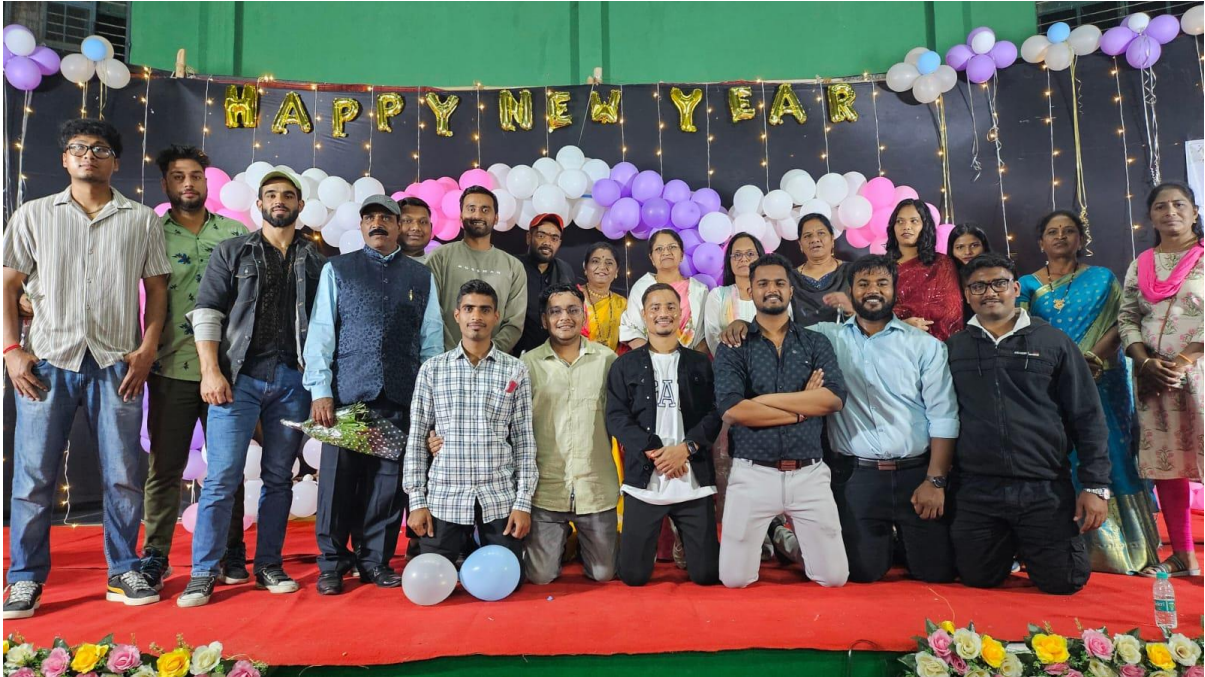
NEW YEAR CELEBRATION