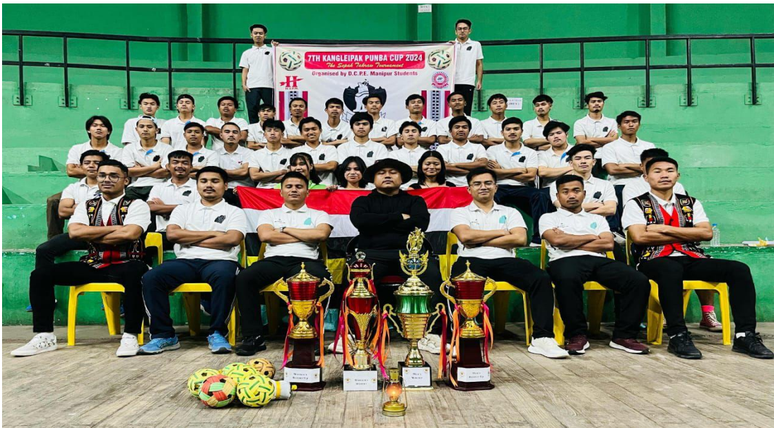
KANGLEIPAK PUNBA CUP