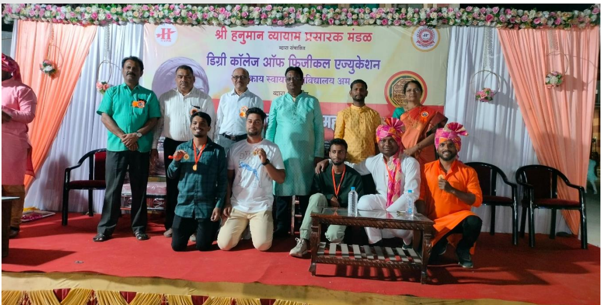
CHHATRAPATI SHIVAJI MAHARAJ JAYANTI