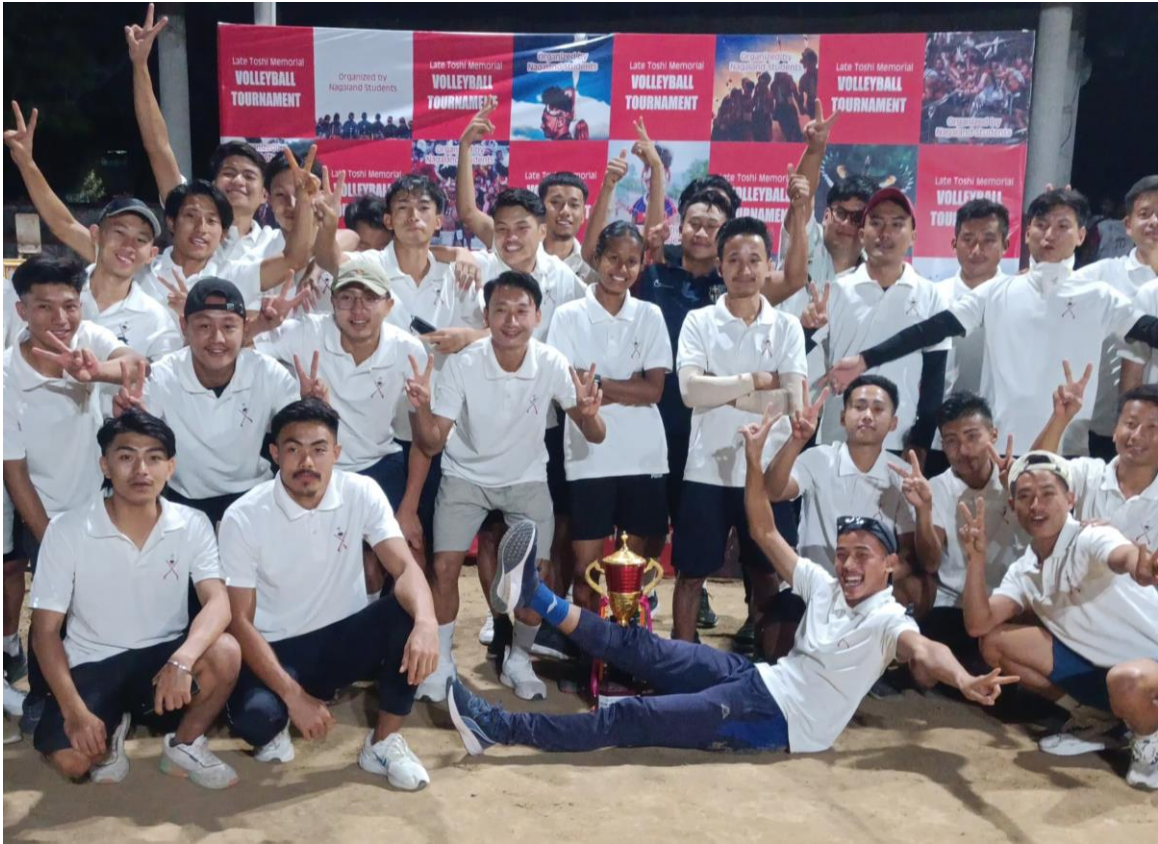
LATE TOSHI MEMORIAL TOURNAMENT